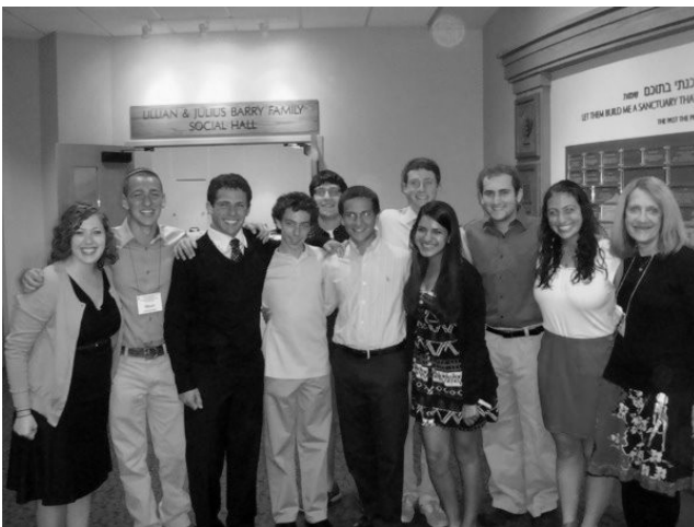
STUSY at Fall Boards/Freshman Kinnus in Toledo!!